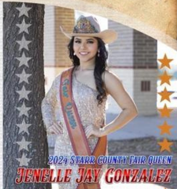
2024 STARR COUNTY FAIR QUEEN